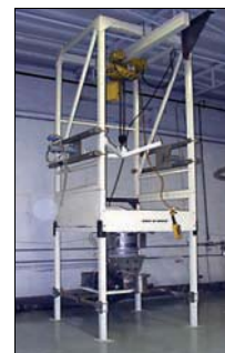
Bulk Bag Unloader