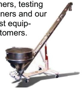
Split Tube Conveyor

Railcar unloading, feeding, blending, grinding, product packaging—an entire system from start to finish—Pace has you covered. Our capabilities ensure that your project is on time, on target and on budget.